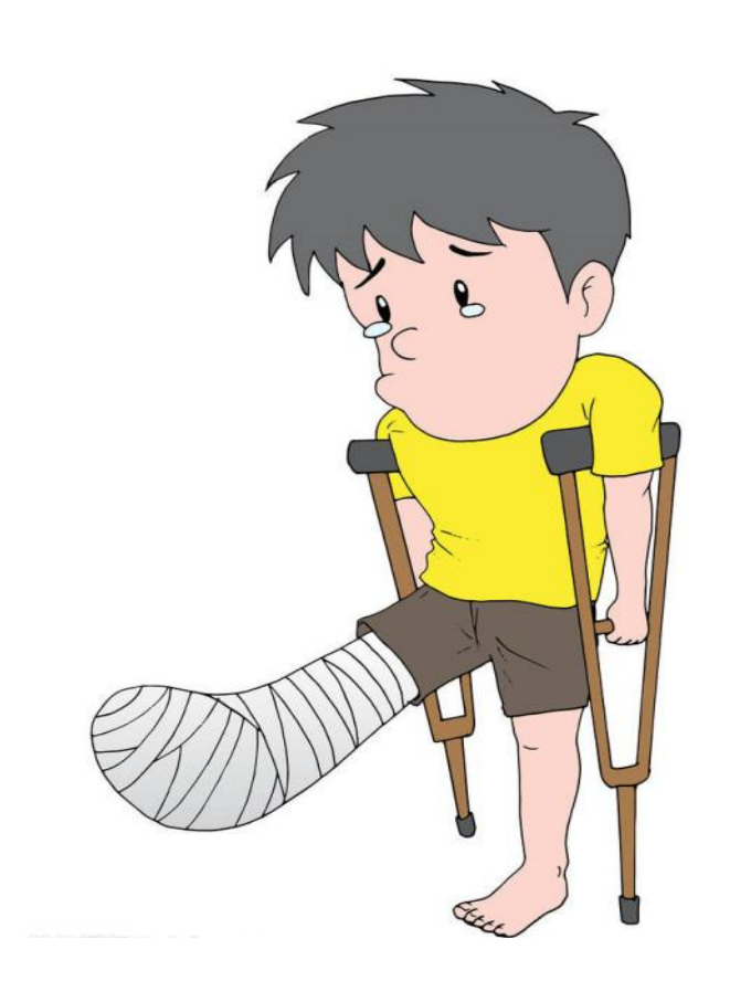
a broken leg